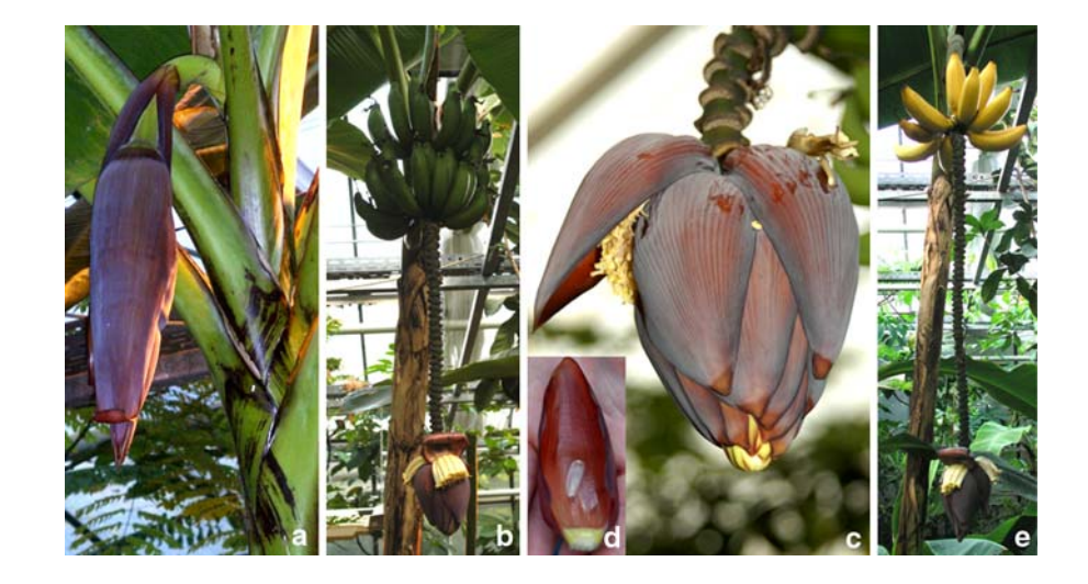
Fig. 2 Vegetative parts (a) and infrutescence ( b–e ) of the Musa ( AAA ) 'Umq Bir' clone (2n = 3x = 33) from Umq Bir, upper Wadi Tiwi, Oman

Simmonds 1987), as well as of several specialists in Musa taxonomy, the specimen could not be identified more exactly, although a vague similarity with some cultivars growing in the Comores can not be excluded (Bioversity International 2006; Horry, CIRAD France, personal communication). We therefore named this clone Musa (AAA) 'Umq Bir'. Research on molecular markers for precise classification of Musa cultivars is only recently progressing so that no molecular references can yet be used.